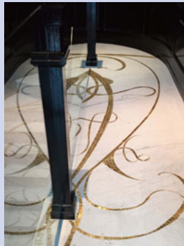
Cathleen Newsham was juried into 2018 MAI Boston with SOHO Penthouse Inlaid Mosaic Floor H 15' W 5'. White marble, 14-karat-gold backed mosaic glass tile