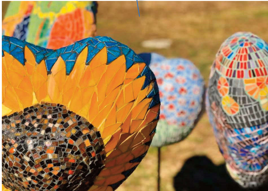
ABOVE: Detail of some of the many mosaic heart sculptures created for the Field of Hearts/Art in the Orchard in 2019 by 20 NEMS members who collaborated by sharing resources and knowledge. See link to video here.

Being strictly a volunteer organization can bring many challenges. We try to focus on tapping into our members' strengths and ability to help without them feeling burnt out. We have found that it can be difficult to find people to take on roles within the organization, especially roles of leadership such as Committee Chairs or roles on the Executive Board. In